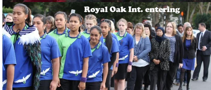
Royal Oak Int. entering