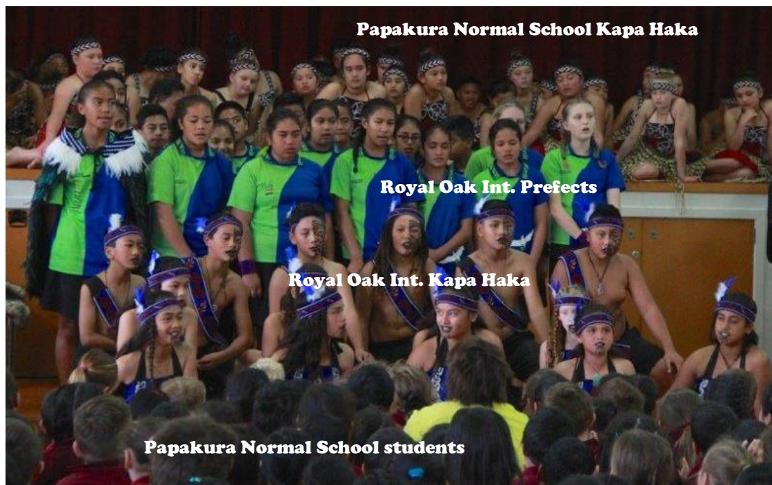
Papakura Normal School Kapa Haka

I would like to thank the kapa haka groups from both Royal Oak Intermediate and Papakura Normal Schools for their outstanding performances.